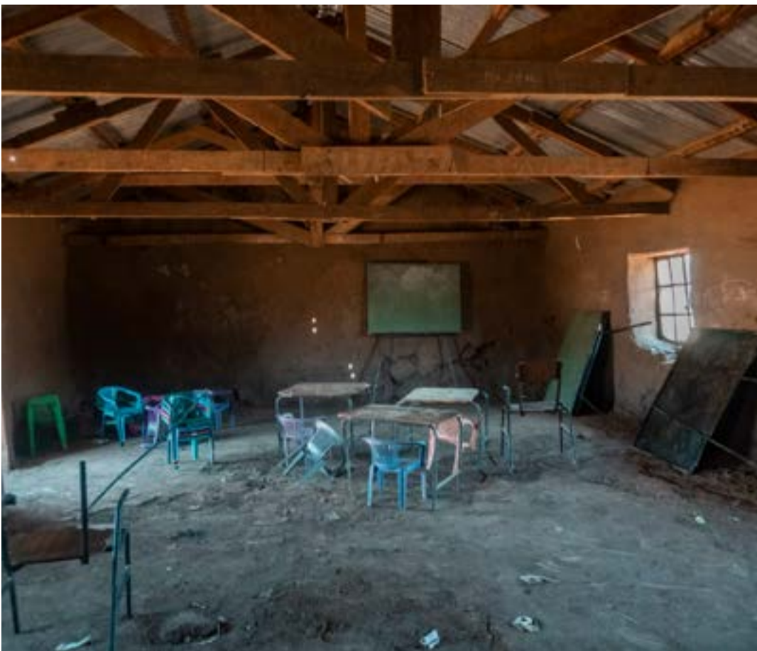
A classroom at Vuka Mosotho Primary School