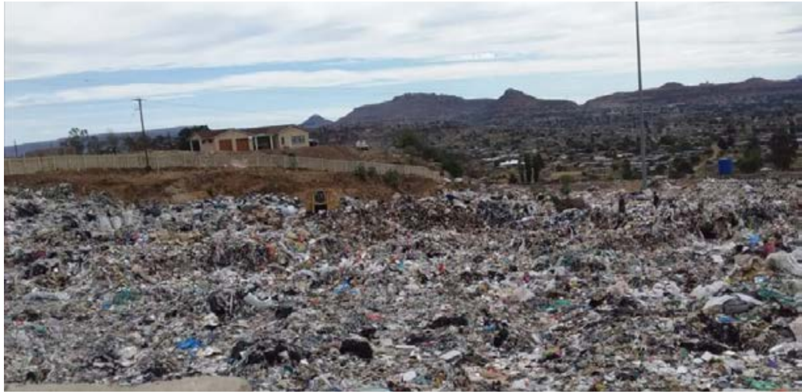
Ha Ts'osane dump site

Just yesterday (Wednesday), representatives