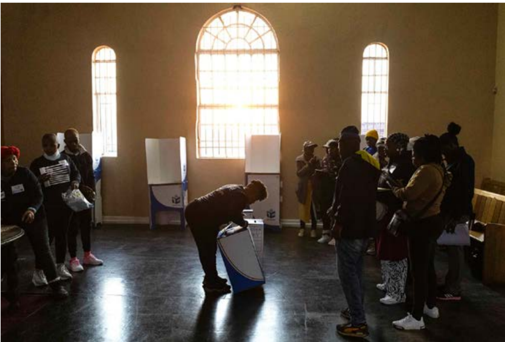
Election staff prepare a polling station as citizens arrive to cast their votes during the South African general election in Johannesburg

“The sentiment among the youth is that ‘we are sick and tired of being sick and tired’ and amongst the elders, there is the sentiment of ‘better the devil you know than the one you don’t, I am personally ready to roll the dice on a new devil,’ he said. DM