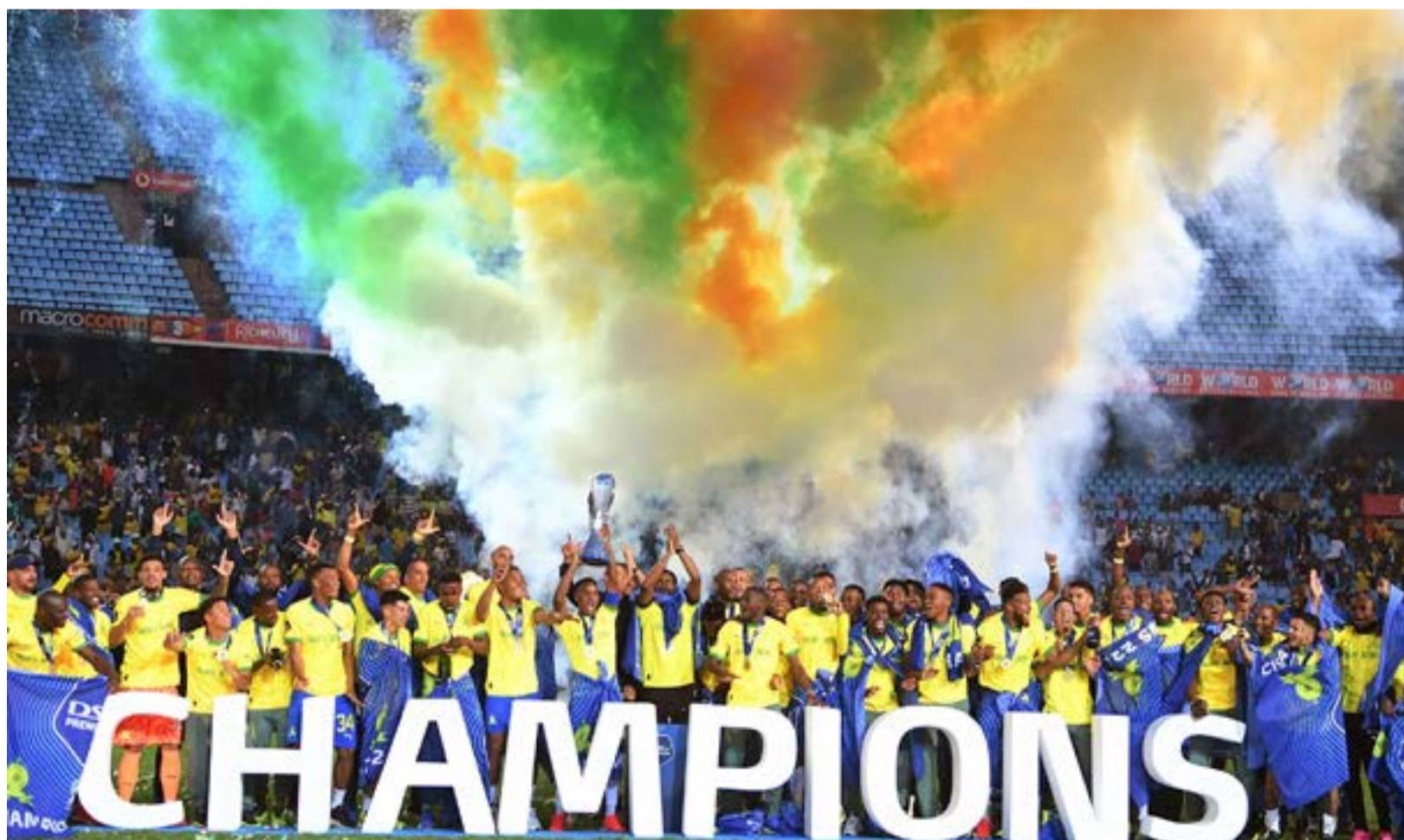
Mamelodi Sundowns celebrate following their DStv Premiership clash with Cape Town City FC at Loftus Versfeld Stadium in Pretoria, South Africa.

However, none of those legendary coaches in South African soccer managed to do it while accumulating a record points haul of 73 after 30 games. Nor did they manage to leave the second-placed team trailing by a