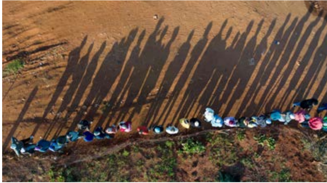
A drone view shows people queuing at the Hospital Hill township to vote during the South African elections, in Johannesburg, South Africa.