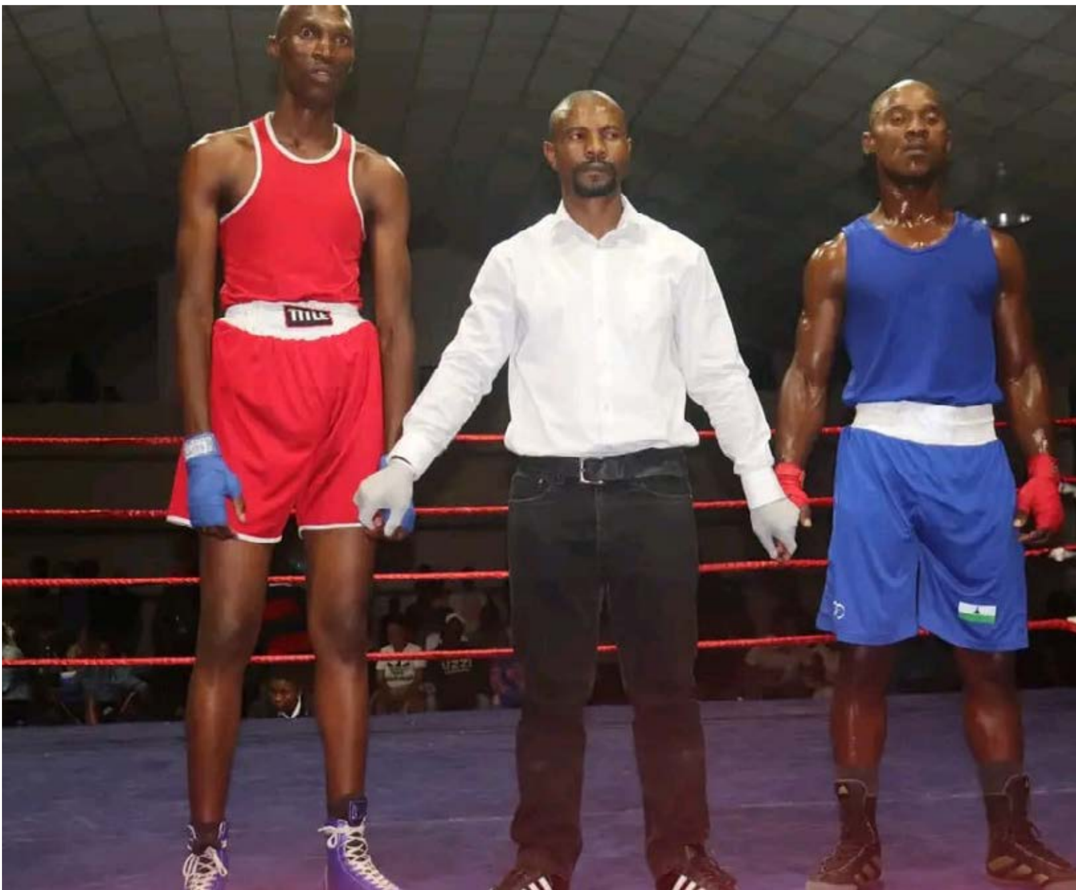
Boxing champion file picture